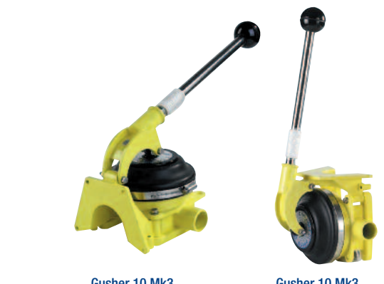
Gusher 10 Mk3 Standard BP3708

Whale high quality bilge accessories including non-return valves, elbows and Y pieces see page 48 - 51